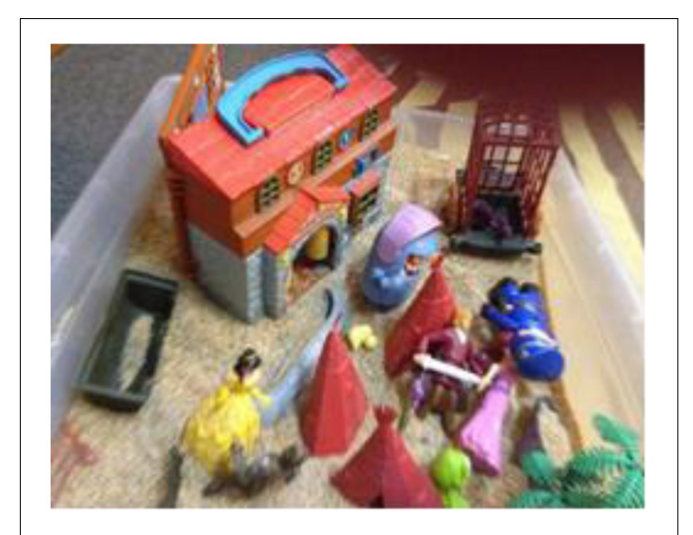
FIGURE 2 | Example of mobile play (W-V2).

Additional emerging themes in participants' stories include threatening environments (hostile and dangerous surroundings), safety measures (to defend against threats or danger), social control (authority and public order), transformation (characters that shift from bad to good or that die and are reborn), family (dynamics and social roles) and nourishment (feeling full or hungry).