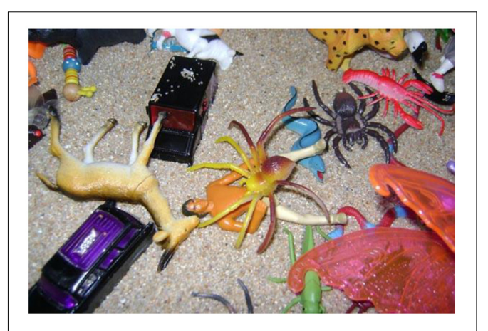
FIGURE 3 | Example of violence in play (V-V1).

In general, throughout all phases of treatment, participants' stories involve plot lines where evil and good are central to identifying characters in the game. On the one hand, "good" individuals are characterized by their ability to protect and provide aid to others in the face of aggressors or dangerous situations. For example, a policeman reports and imprisons those who commit crimes. On the other hand, "bad" individuals are identified by their unlawful behaviors and violent actions toward